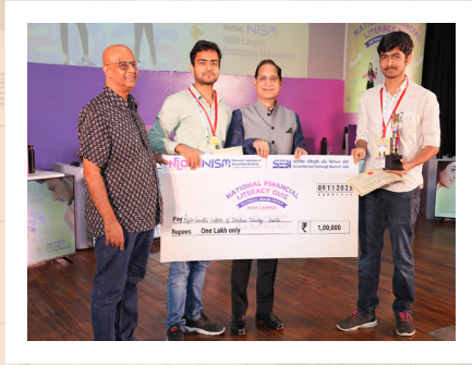
2nd Prize Rs. 1,00,000/- Rajiv Gandhi Institute of Petroleum Technology, Amethi