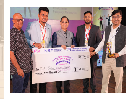
3rd Prize Rs. 60,000/- ICFAI Business School, Kolkata