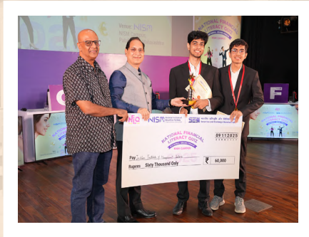
3rd Prize Rs. 60,000/- Indian Institute of Management Indore, (IIM Indore)