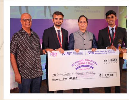
2nd Prize Rs. 1,00,000/- Indian Institute of Management (IIM-Shillong), Shillong