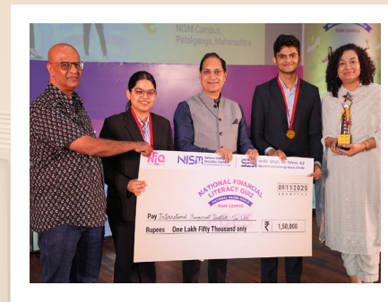
1st Prize Rs. 1,50,000/- International Management Institute, New Delhi