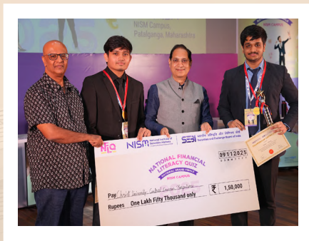
1st Prize Rs. 1,50,000/- Christ University Central Campus, Bengaluru